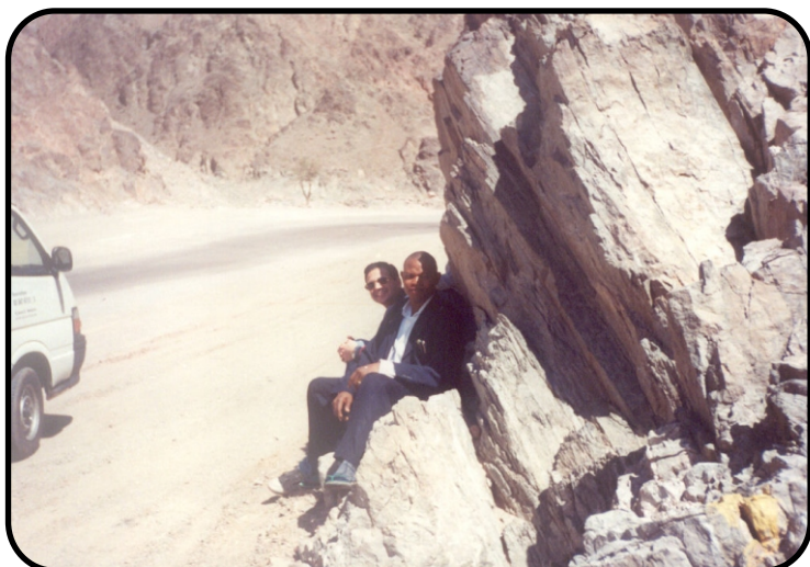
Pix 11: Relaxing at Mount Sinai - the Site where Moses Received the 10 Commandments