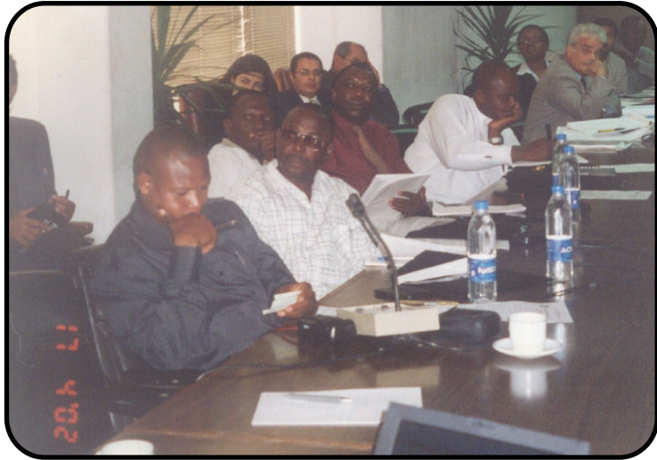
Pix 7: Intensive lecture/Studies at Urban Training and Studies Institute (UTI)