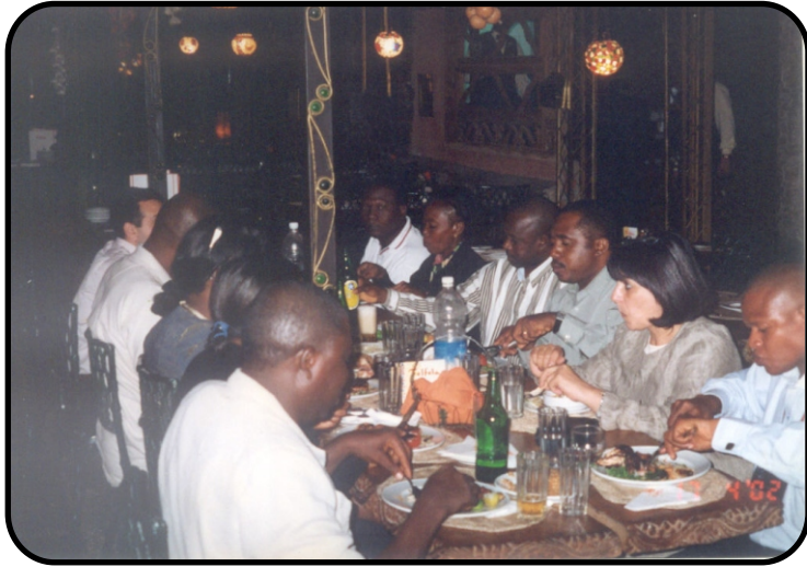
Pix 1: Welcome Dinner @ Felfela Restaurant in Cairo, Egypt.