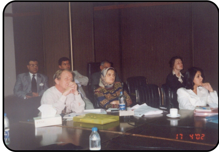
Pix 8: Other Nationals and Participants at Urban Training and Studies Institute (UTI)