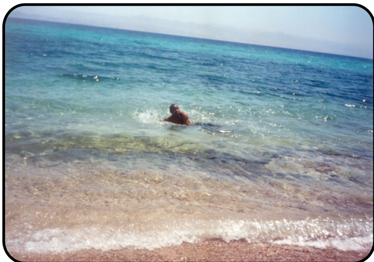
Pix 5: Unwinding: Swimming in the Red Sea was part of the study tour.