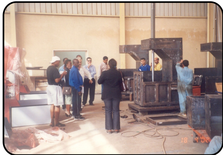
Pix 10: Visit to Waste Handling equipment manufacturing Company in Egypt.