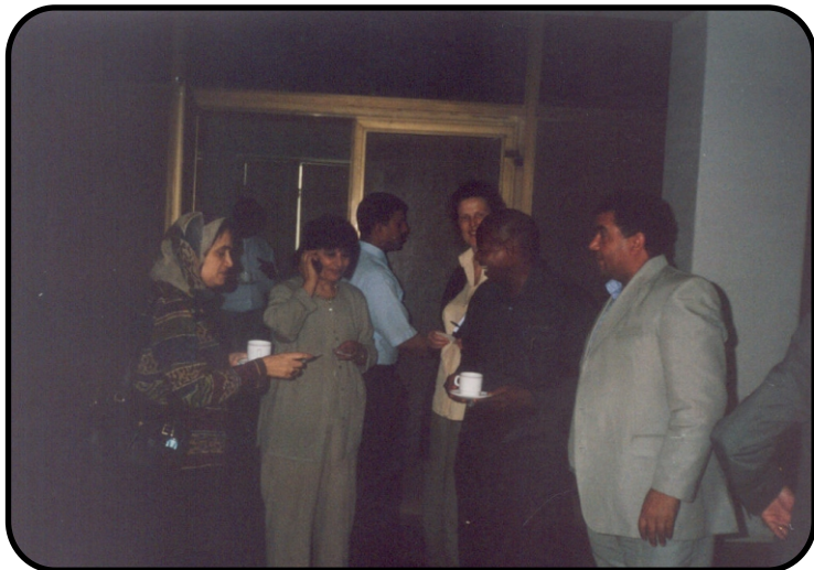
Pix 9: Tea Break and Networking at Urban Training and Studies Institute (UTI)