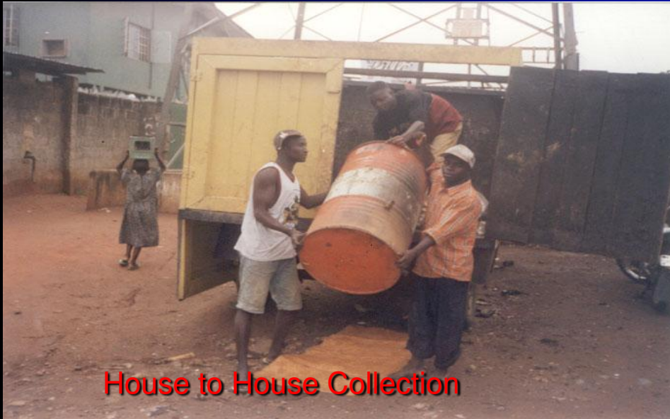
House to House Collection