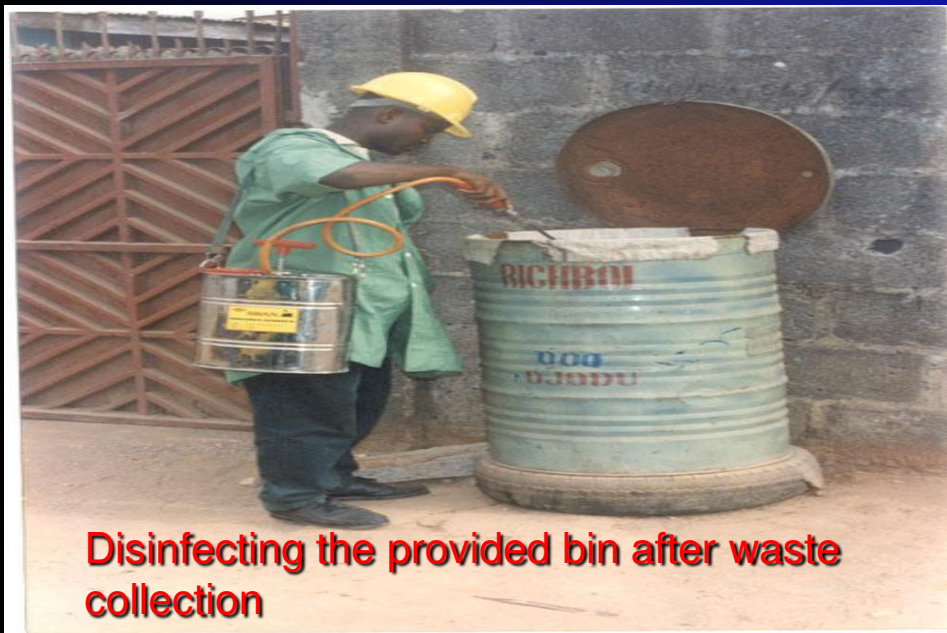
Disinfecting the provided bin after waste collection