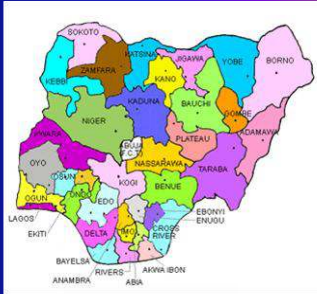
Map of Nigeria