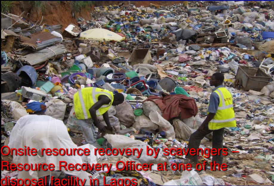
Onsite resource recovery by scavengers – Resource Recovery Officer at one of the disposal facility in Lagos