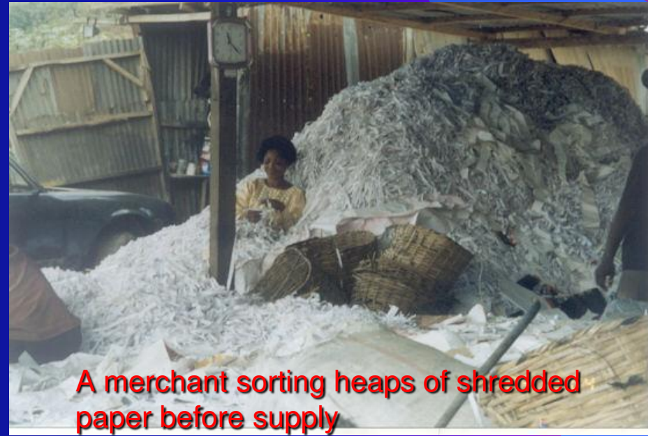
A merchant sorting heaps of shredded paper before supply