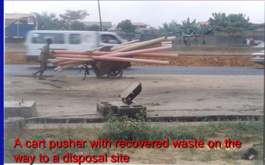
A cart pusher with recovered waste on the way to a disposal site