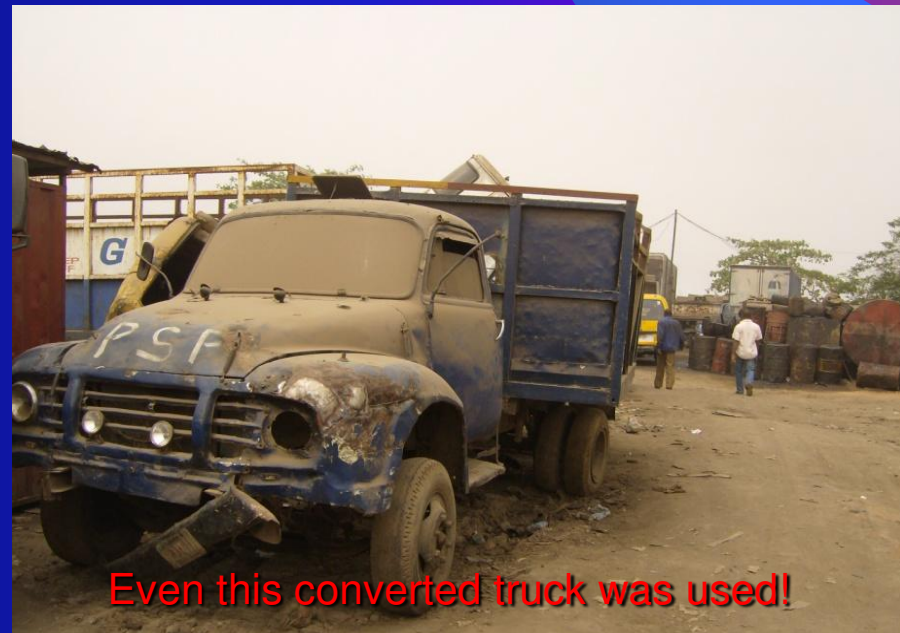
Even this converted truck was used!