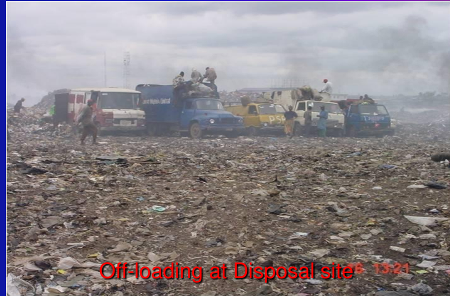
Off-loading at Disposal site 13:21