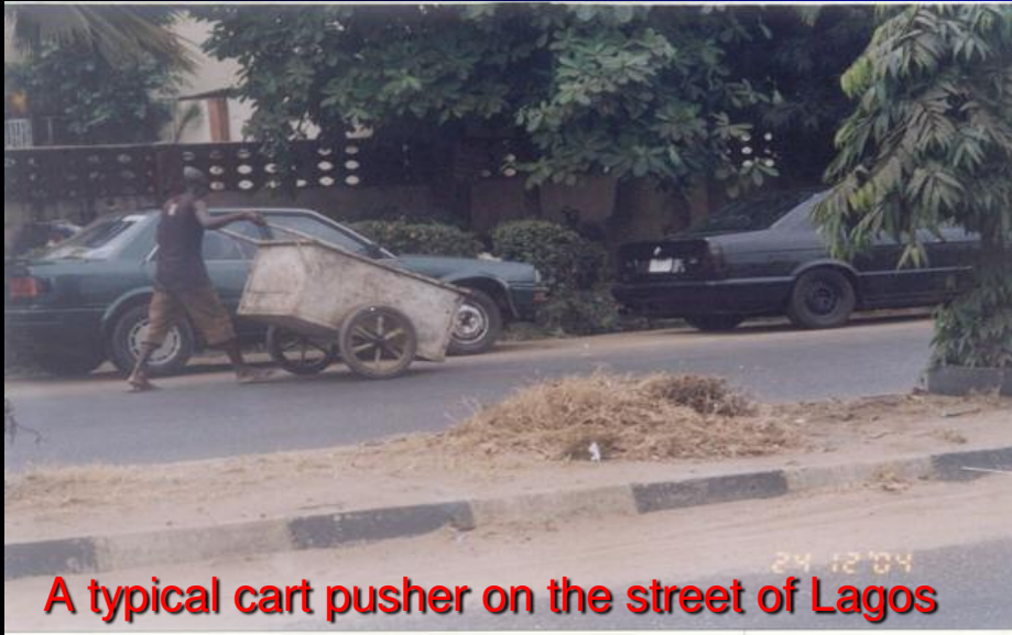
A typical cart pusher on the street of Lagos